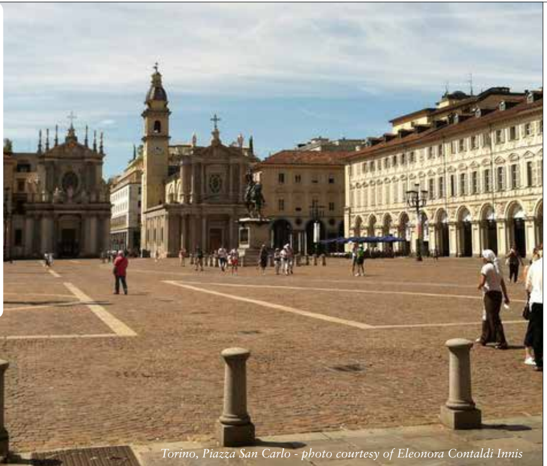
Torino, Piazza San Carlo - photo courtesy of Eleonora Contaldi Innis