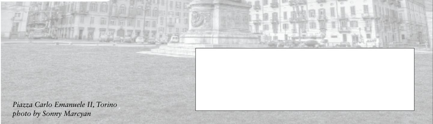
Piazza Carlo Emanuele II, Torino